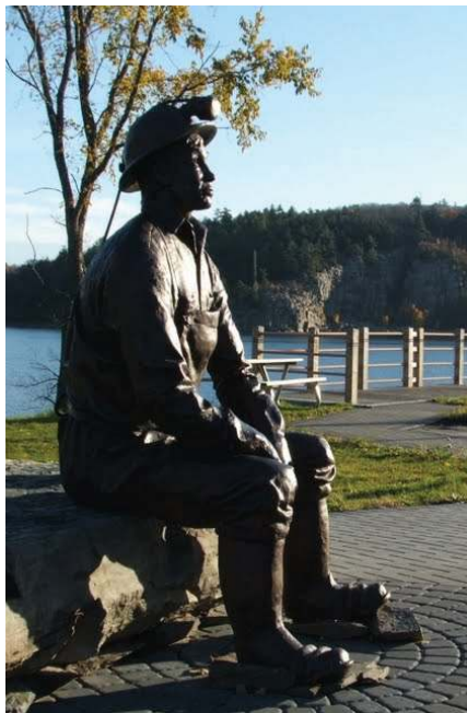
Mining Monument and Memorial Park, Elliot Lake, Ontario

According to officials of the United Nations International Atomic Energy Agency (IAEA), the Radiation Safety Institute of Canada is unique. It is the only independent institute of its kind in any country.