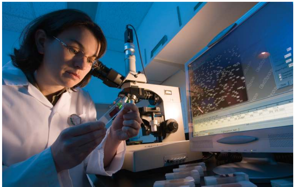
RSI National Laboratories, Saskatoon Saskatchewan

In response, we put together a team of internationally recognized scientific experts (from Canada, France and Switzerland) to test independently the companies' radiation safety design of the new mines and mills.