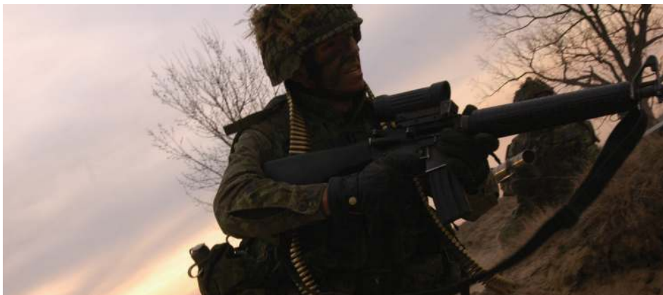
CFB Borden.