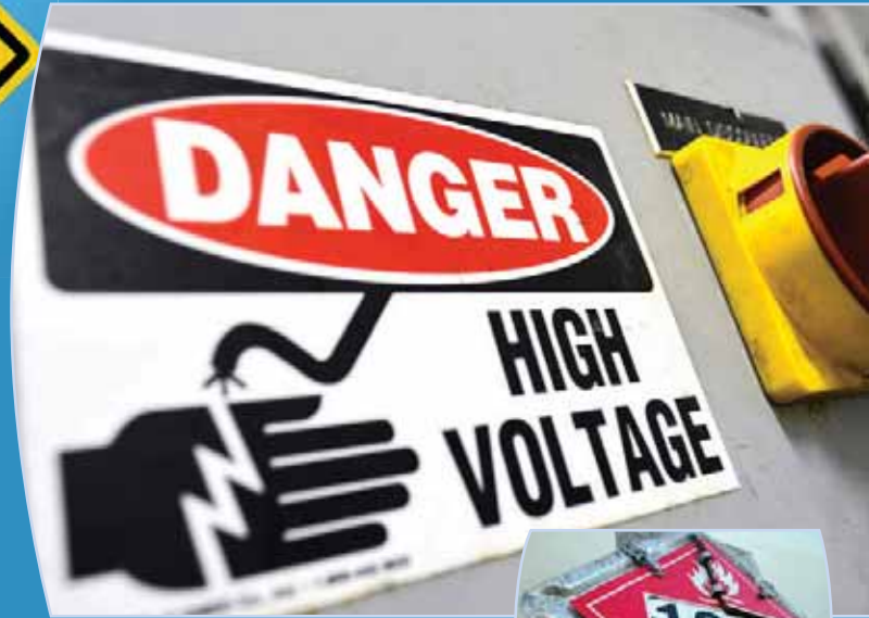
High Risk Pavilion